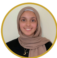
Shifa Marketing Design