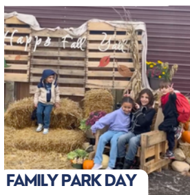
FAMILY PARK DAY