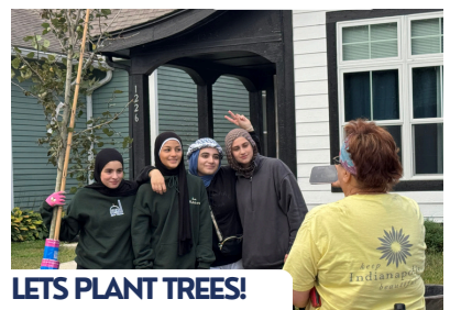
LETS PLANT TREES!