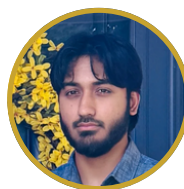
Arsal Video Editor