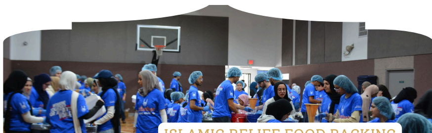
ISLAMIC RELIEF FOOD PACKING